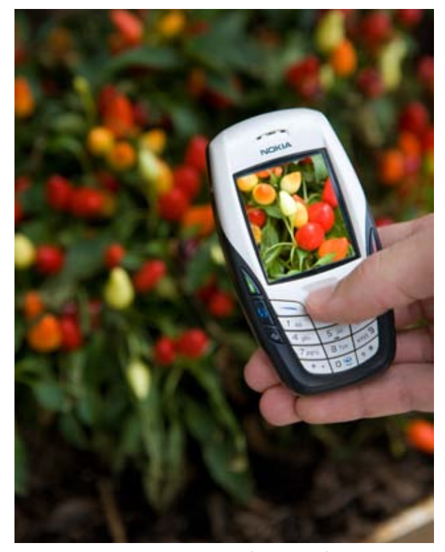
Fruiting is a key event in the life cycle of many plants. Large-scale citizen-generated information on the timing of such key events can be an indicator of climate change.

images. Other data processing tricks help prioritize images for viewing based upon patterns observed in previously processed images. Scientists are also developing measures to document the reliability of individual data collectors; information that can be used to estimate and account for the uncertainty inherent in the large-scale use of citizen-gathered data. Enabled by common and abundant mobile phones, this ongoing citizen science project gives researchers access to a unique data set that sheds further light on the environmental impacts of climate change while simultaneously building hobbyist communities of gardeners and plant enthusiasts.