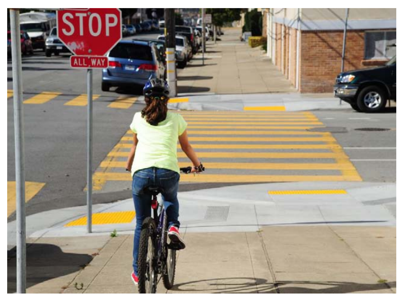
Bicycle commuting is healthy and environmentally-sound but not always safe or enjoyable. CycleSense is a personal tool for tracking commuting and can also tap into the collective wisdom of cyclists in an area to help find high-quality commuting routes.

CycleSense users carry a GPS logger or a mobile phone equipped with GPS technology during their commute. These tools automatically upload their routes to a secure website. Participants log in to their private website and see their route combined with existing data, including air quality, time-sensitive traffic conditions, and aggregate traffic accidents along the