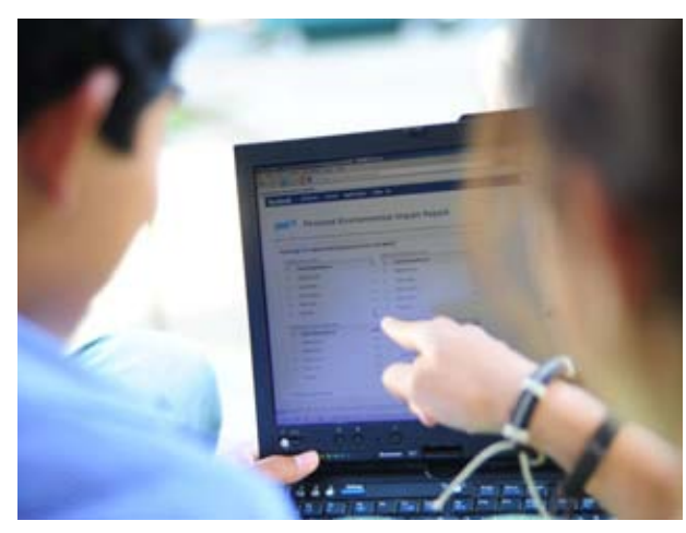
PEIR users can investigate their impact and exposure metrics and compare their results with others in their social network.

to which these children are exposed. You examine how these patterns change as you vary your routine by logging in to your personal, secure PEIR website. A travel diary with maps of your daily routes, as well as displays of your emissions and exposure to particulate matter, helps you interpret what your actions mean for your health, the health of others, and the environment. Because information about your location and daily habits is very sensitive, PEIR encrypts the data and allows you to share it only with people you trust. You can also choose to compare aggregate, less-sensitive information about your emissions and exposure to friends using social networking sites like Facebook. PEIR empowers you to decide whether different routes can make a positive difference in environmental impact and exposure.