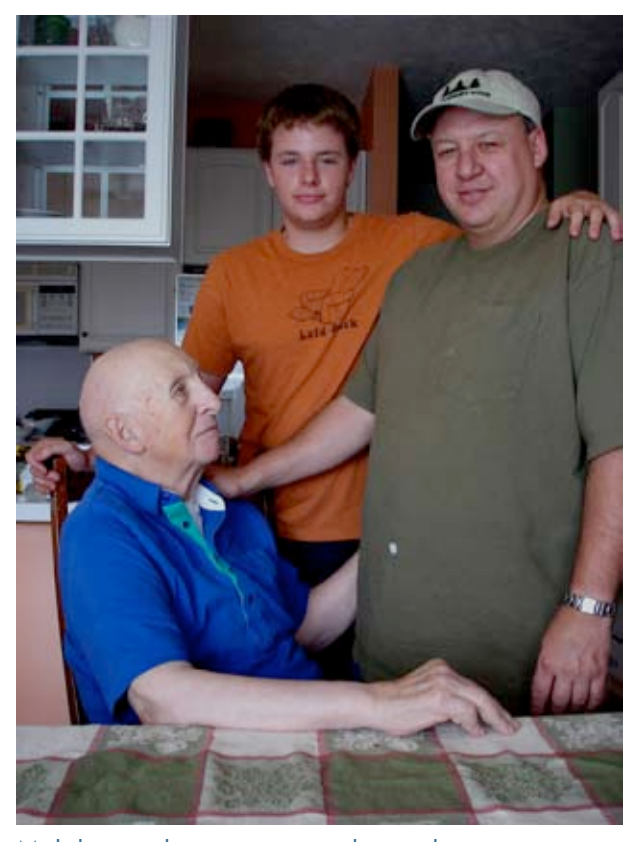
Mobile-to-web systems can be tools to encourage and support aging in place, while giving families confidence that their loved ones are safe.

Increasingly, seniors are living longer and wanting to remain at home among friends and familiar patterns in their community, while still having access to support services appropriate to the changes they are undergoing. This trend, called "aging in place," gives seniors a well-deserved degree of independence, but can also increase the risk that declines in health may not be noticed early enough to provide the most favorable intervention.