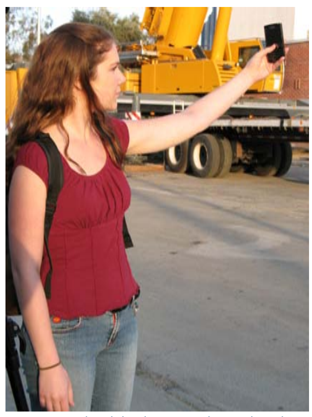
GPS-equipped mobile phones can be used to photograph diesel trucks as part of a campaign to understand community exposure to air pollution.

By logging in to a website, campaign organizers and participants could view a customized, continually updated traffic map of their neighborhood, making the geographic distribution of heavy truck traffic immediately visible. They could also view the map according to time of day to pinpoint hours when truck traffic was highest. As the system alerted campaign organizers about areas of the city or times of day when more