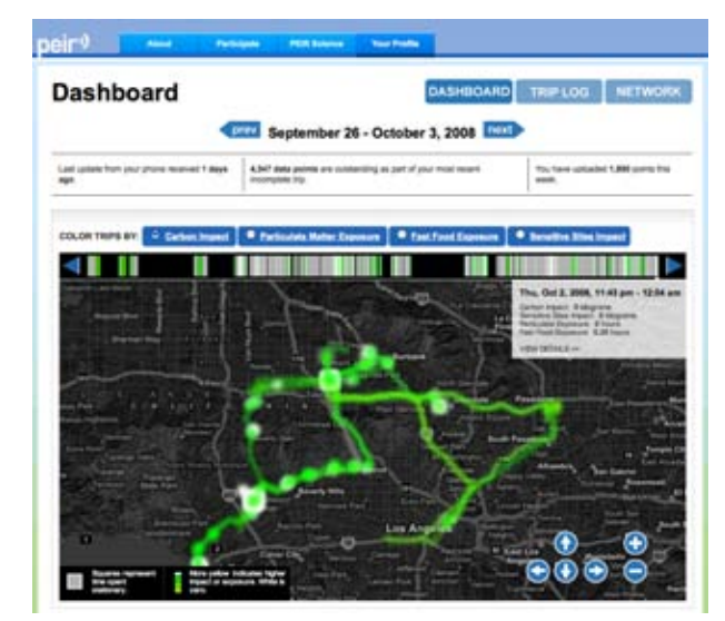
The PEIR dashboard maps your travel habits in colors corresponding to environmental factors. Other elements of the dashboard (not shown) graph daily totals over the previous week to help individuals identify patterns and discover the results of changes they make in their travels.

Spurring the PEIR group's conversations is more than a casual interest in the environment and members' health. All the people at last night's gathering are using a new online service that interacts with their mobile phones to give them detailed personalized information about their effect on the environment, and their environment's effect on them. Worrying about the environment is not new, but the kind of information that people can gather about it is. PEIR complements and extends carbon footprint calculators, which use information about the size of your home, the setting on your air conditioning, and other static factors to estimate your carbon emissions. PEIR takes a more personal approach by considering your location and travel patterns to provide information not only