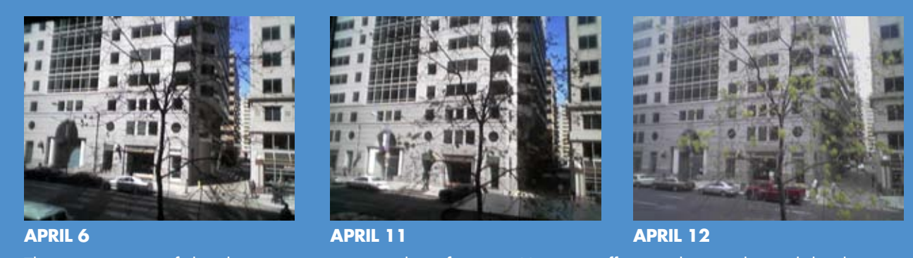
The greening up of deciduous trees is one marker of spring. Here, an office worker used a mobile phone to

from their buds—participants take photographs of the plant and apply descriptive keyword tags, such as the name of the plant and the observed life stage. Meanwhile, the phone records the location of the plant using its built-in GPS. The data are then uploaded to a personal participant website. If a plant happens to grow in a "dead zone" with no cellular coverage, the phone simply stores the data and sends it along the next time it connects.